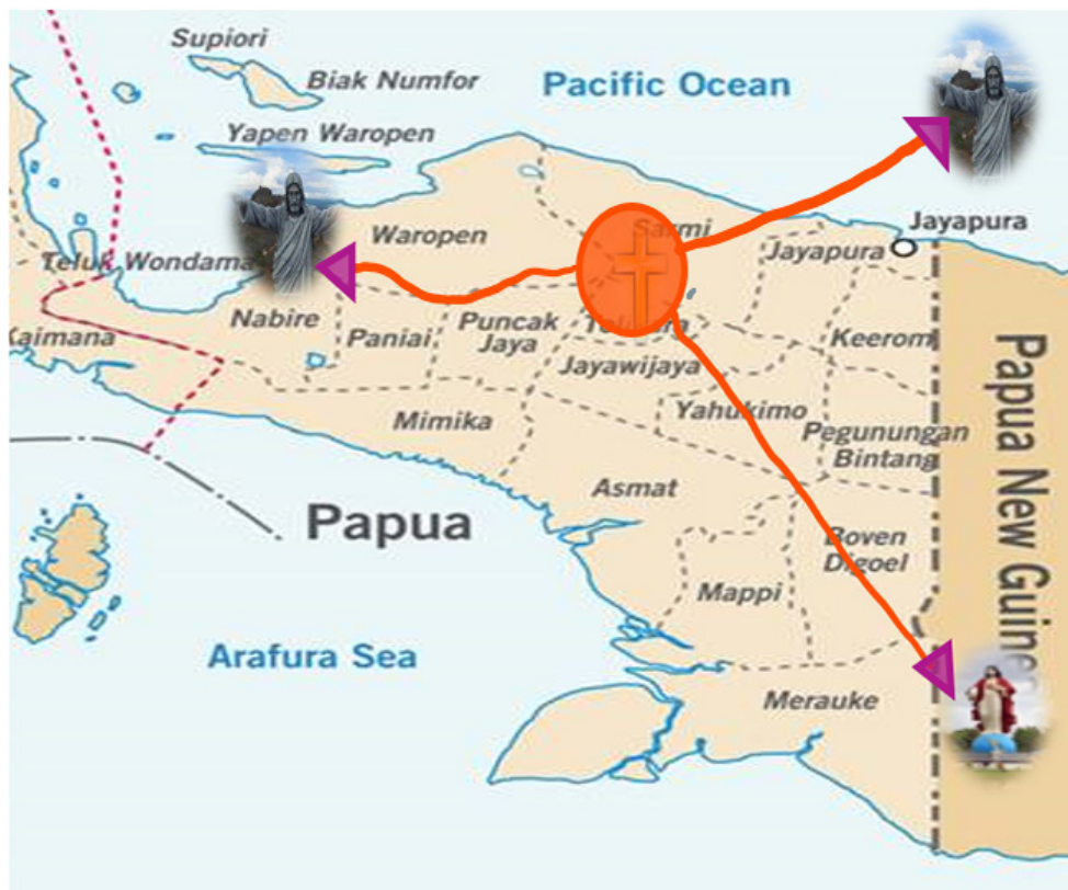
Figure 2 Papua map and configuration of religious symbols

Elsewhere, in the Mountain, a Giant Crucifix Monument in Wamena has just been completed which is named Wio Silimo, while in Merauke District, two giant statues of Jesus the Redeemer in Mopah Airport as high as 12 meters and Habe Island as high as 26 have also been erected. In general, almost every city in Papua will surely find religious symbols that are deliberately created and gain legitimacy from the local government. It is interesting to pay attention to the distribution of religious symbol construction, because it will display a unique configuration, which can be seen in the following figure 2.