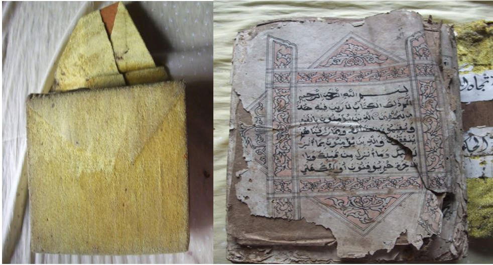
Picture 1 showing the Qurán of Guro sa Masiu of Taraka, Lanao del Sur and the other side is the Surah Al-Fatiha of the Qurán of Guro sa Masiu.