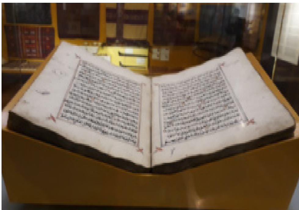
Picture 3: The Qurán of Bayang. The collection of the author taken at the National Museum of the Philippines during her trip to Manila, November 20, 2019.