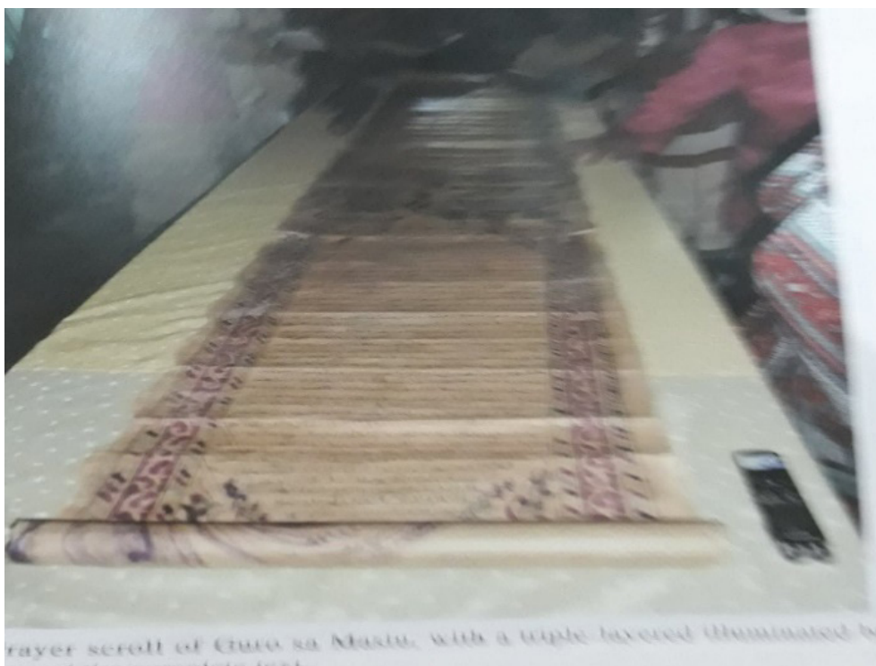
Picture 4: Prayer scroll of Guro sa Masiu, copied from my article in Sophia Journal