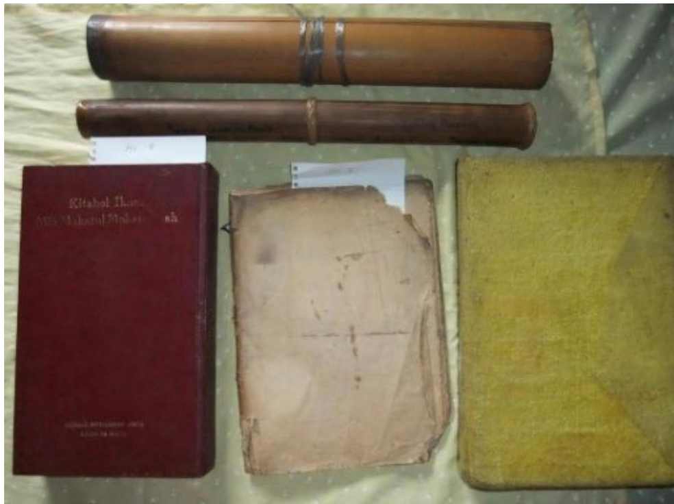
Picture 5: Some other manuscript of Guro sa Masiu with the Bamboo tube were the manuscript were kept for them to preserved.