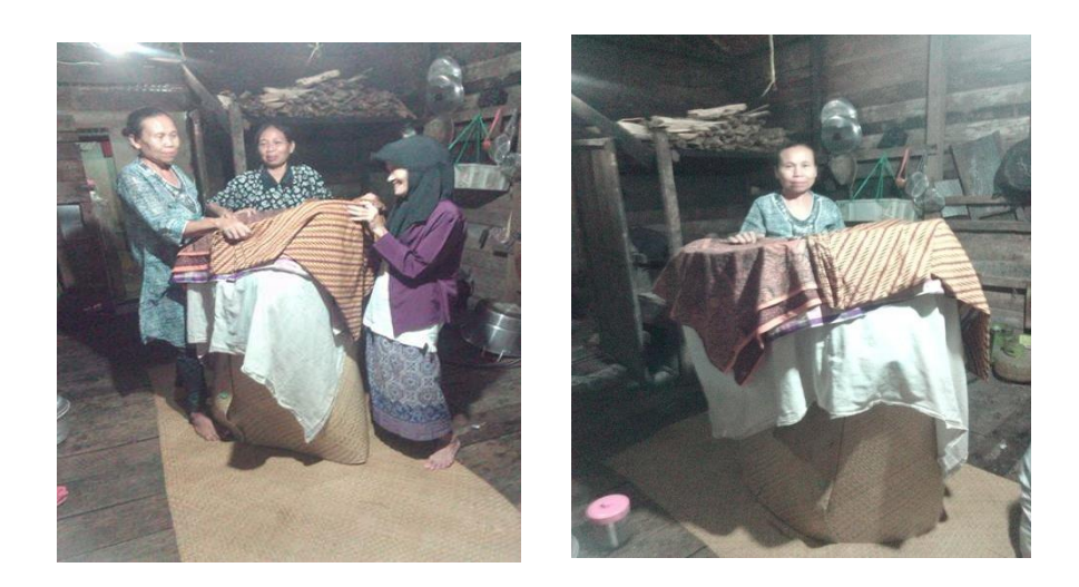
Picture: 4 Prospective brides are in a roll of mats covered with cloth

10. Masang Cerengok (inai) . This event is held at night . The implementation of the dating / inaugural event was carried out by the two brides in their respective