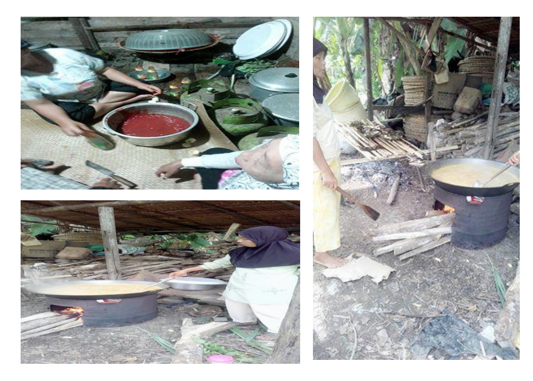
KHATULISTIWA: Journal of Islamic Studies Vol. 8, No. 1. March 2018

13. Nyemeleh and Berapi (Slaughtering and cooking) on this activity, the men slaughter animals that will be cooked as dishes as in weddings and others seek umbut (young part of the coconut tree) be used as a vegetable, after these two materials provided women cut and cook them.