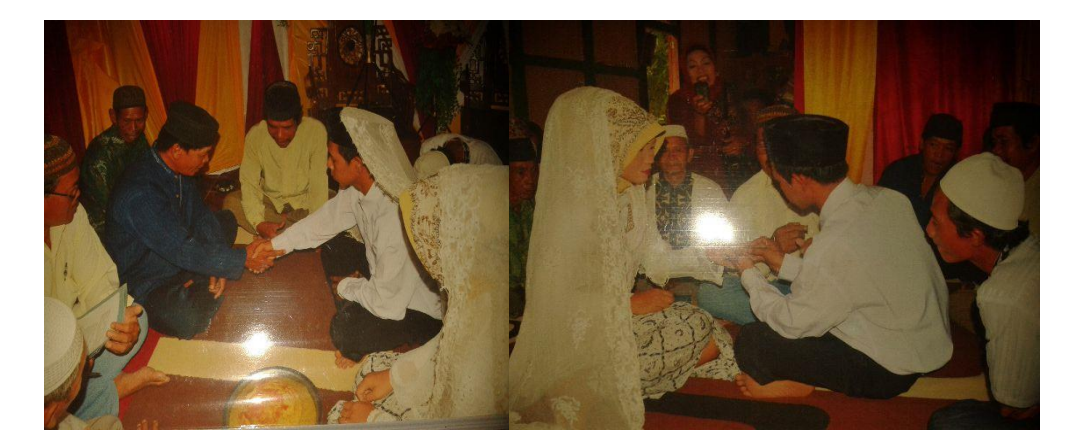
Gambar:12 Akad Nikah