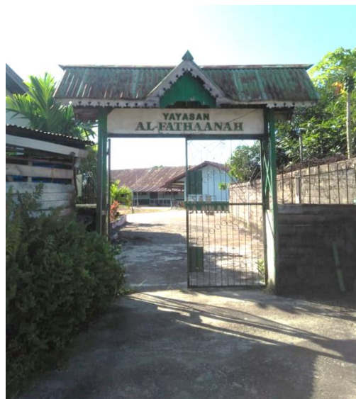
Figure 2. Al-Fathaanaah Foundation