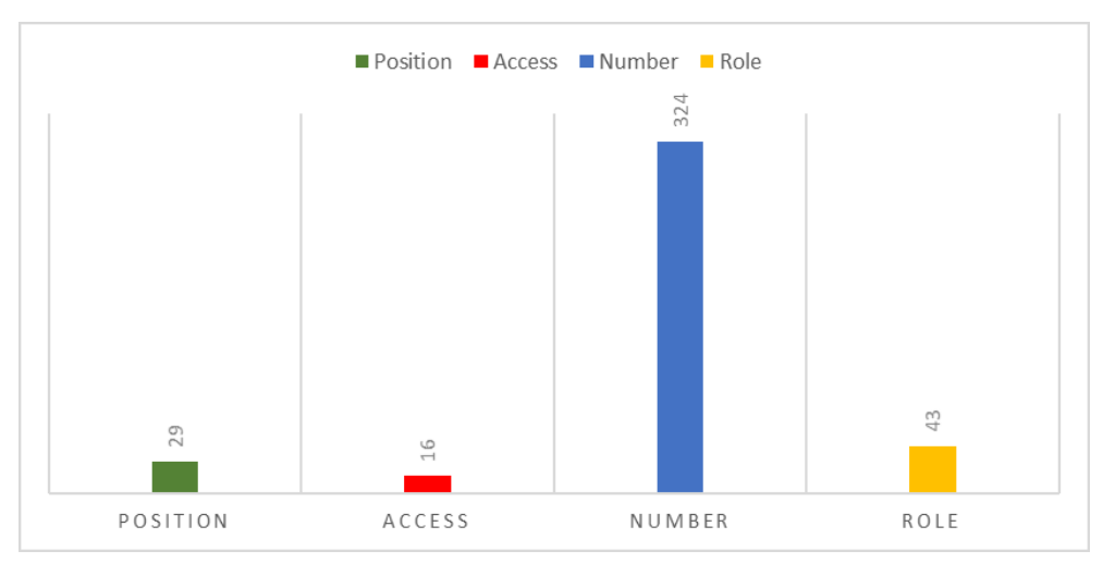
Figure 2. Millennial Muslim Perception about Minorities

minority is also related to "position", "role" and "access". In summary, some of these answers can be seen in the explanation of Figure 2 below.