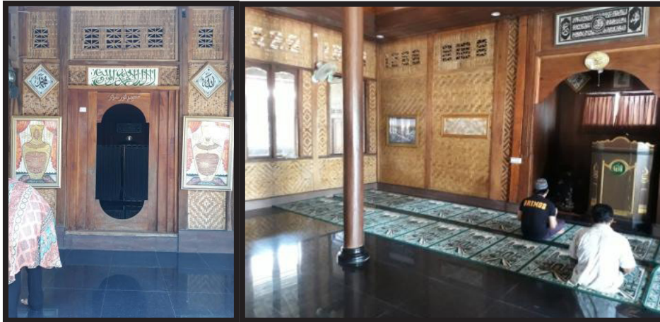
The 'luxurious' entrance and room of the mosque

black ceramic floored, and equipped with a seemingly modern bathroom and a wudu place.