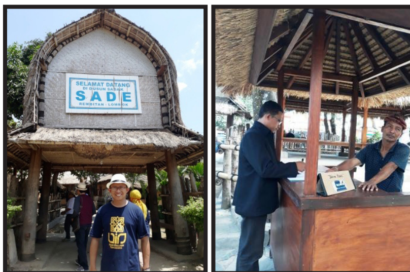
The Entrance of the Sade Traditional Village and the Retribution Post (Personal Document)

Entering the gate, I had to stop at a small post where retribution is collected. There is no specific rate, nor is there a rule that “forces” me to pay. I found only a notice to fill in the guest book in which there is a column for how much money that I donated for retribution. Once again, there is no rule on how much money that I have to pay for retribution. However, the presence of a waiter inevitably encouraged me to fill it. At a glance, I noticed that the nominal as written in the guest book varied, starting from Rp. 5,000 to Rp. 50,000.