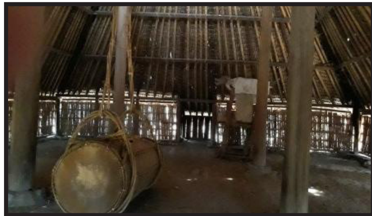
The nuance inside the Ancient Bayan Mosque: a ground floor, a hanging Bedug, a simple pulpit, and a place for a prayer leader (imam).

also have meanings, such as a white color refers to holiness and a red long cloth ( dodot ) to leadership; the dress is equipped sapuq or bongot (headband) (Matindas, 2018). In addition, the rules also said that anyone who enters the area of the ancient mosque should dress in a way that accords the custom.