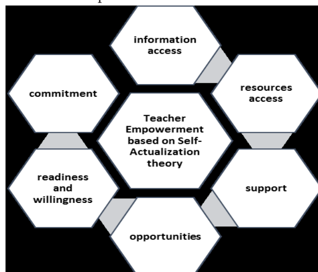
Dimension of Teacher Empowerment based on Self-Actualization Theory