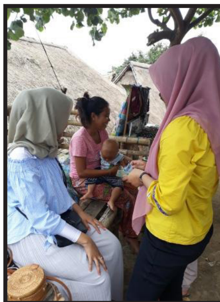
A 14 years-old Sasak Sade woman with her child.

merarik tradition. This phenomenon is not only happening in Sade, but also in Bayan and Ende. As a result, many teenagers had to become widows while having dependents of one, two and three children. In addition, there is a convention in Sade that women should have four children who will in the future hold the four coffin corners of their died parents. The problem is not just about the number of children that a woman should have, but also the fact that a young woman, who is still a teenager and uneducated, has to take care of children in a poor economic condition. Consequently, many marriages ended up with divorce. It is common to see a young and poor divorced woman with many children in Sade. Finally, ignorance and poverty in a systematic and a structured way have been inherited on behalf of local wisdom.